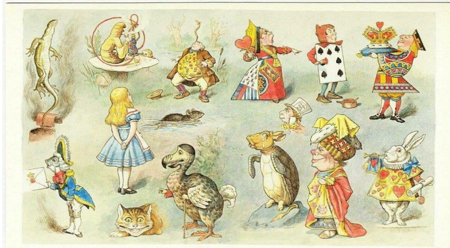
Characters Alice Created in her Dreamworld: Wonderland

mental Alice’s playground where Alice can challenge emotional truths that her waking life does not allow her to directly have.